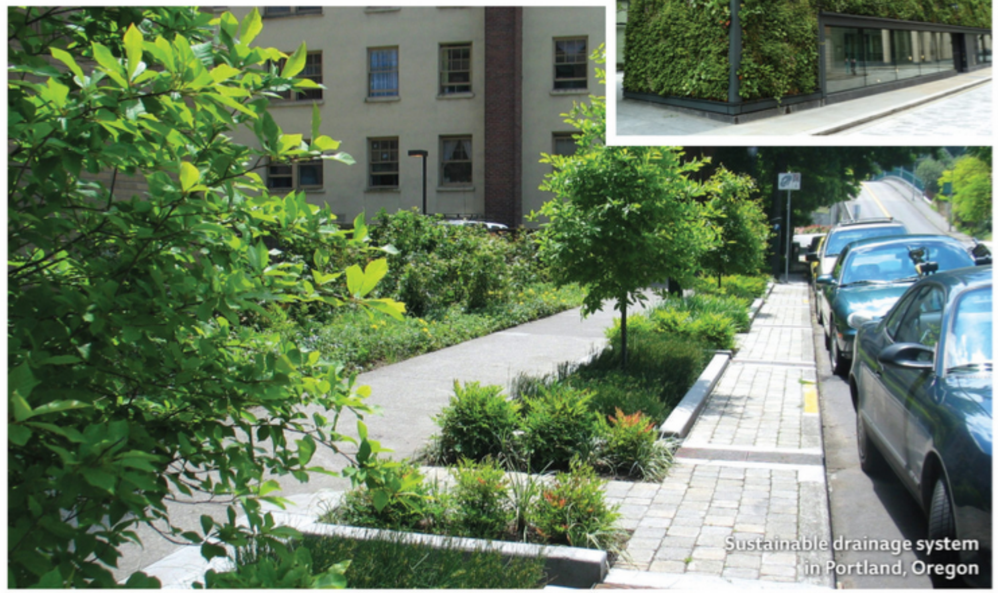
Sustainable drainage system in Portland, Oregon

remember that we should be working with people, rather than for people.