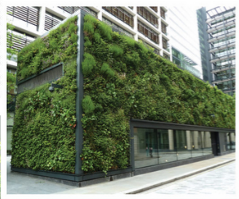
Green wall by Biotecture at New Street Square in London

first step is at least to be aware of the complex interactions between buildings and people, and work out how to manage expectations. If humans are so unpredictable, we can't design and operate our buildings to cater for every eventuality, but we can be flexible and