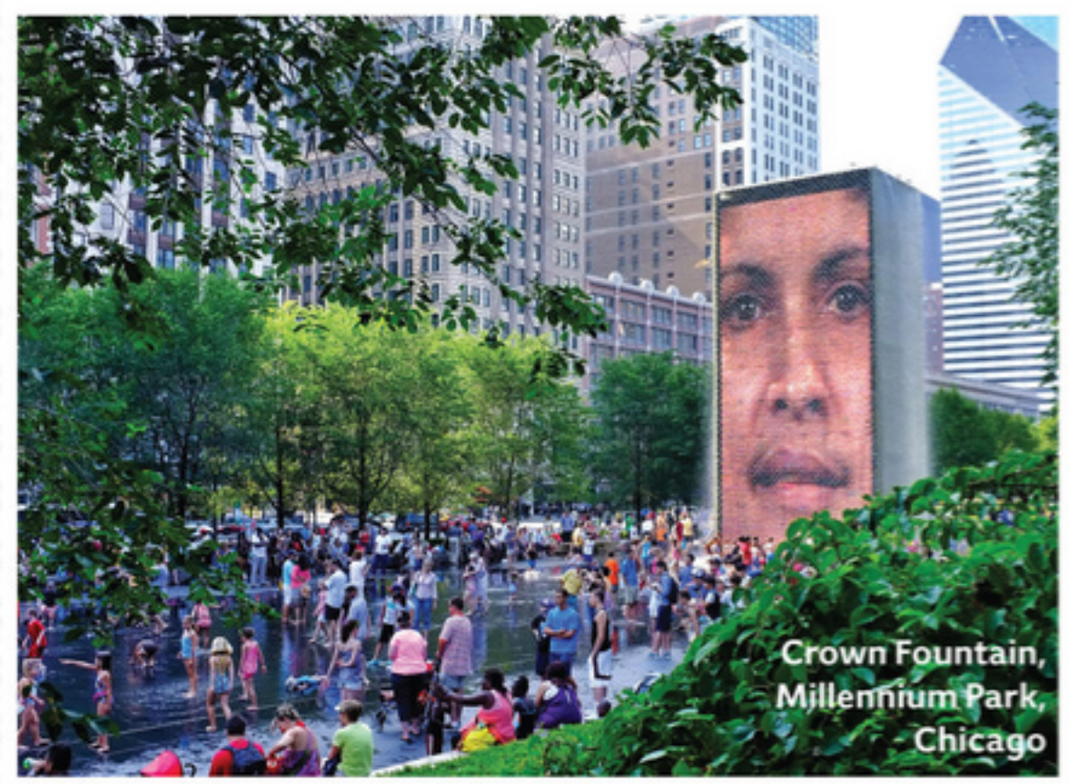
Crown Fountain, Millennium Park, Chicago

We need simple, intuitive, open-source software that makes it easier for users to understand and operate their buildings – an Esperanto for the built environment